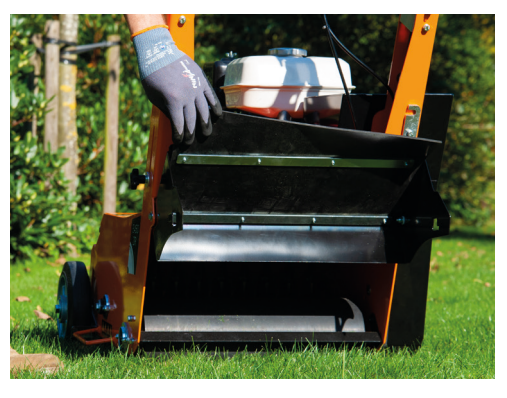
all small bumps and leaves a nice stripe pattern.