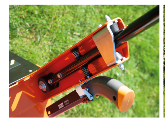
The vibration absorption in the steering wheel ensures a comfortable work feeling.