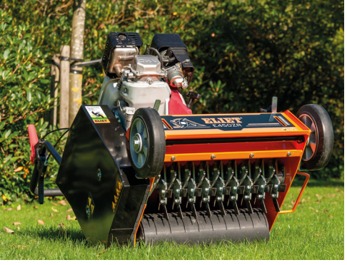
Thanks to the self-sharpening Double Cut<sup>™</sup> blades, the lawn is combed out very thoroughly.