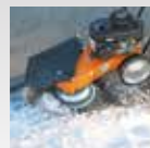
Effective clearance of compressed snow & ice