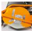
Easy maintenance – simple replacement of the flails and drive belts