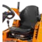
Comfort seat – impressive leg room for tall users and adjustable seat suspension