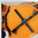
Blade system – lower blade with swing tips and fixed upper cross blade