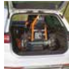
Folding handle bars