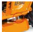
Floating cutting deck – providing additional ground clearance on uneven terrain