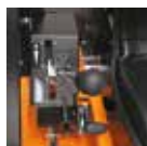
Easy to operate, single lever hydrostatic transmission