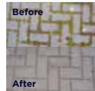
Effective weed removal