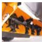
Floating mower deck – adapts to rough and uneven terrain